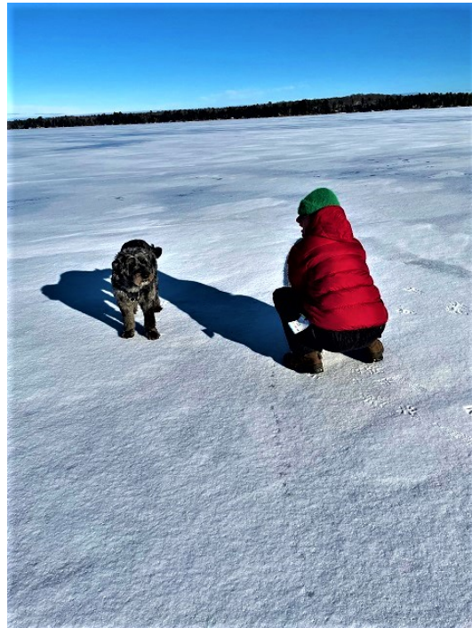
Upper right - Road 1 walk - Donna McNeely