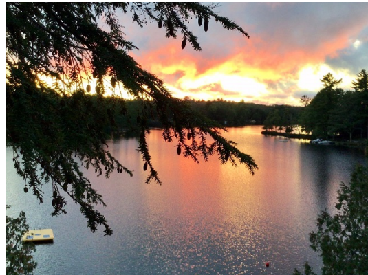
Fall Sunset