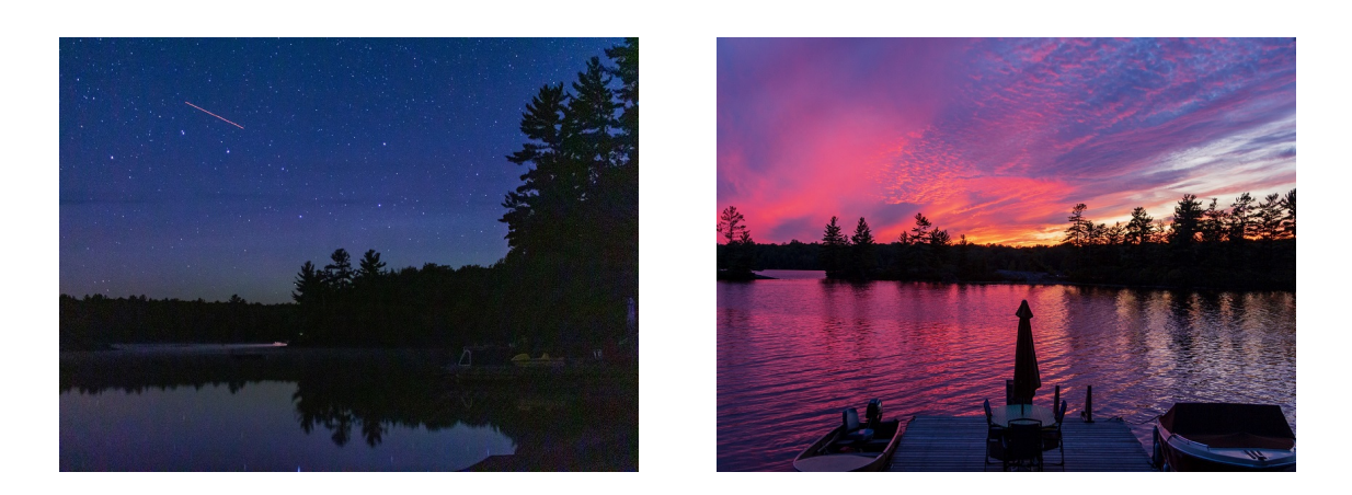
waiting for the northern lights, sunset view, dock visitor, waterfall river