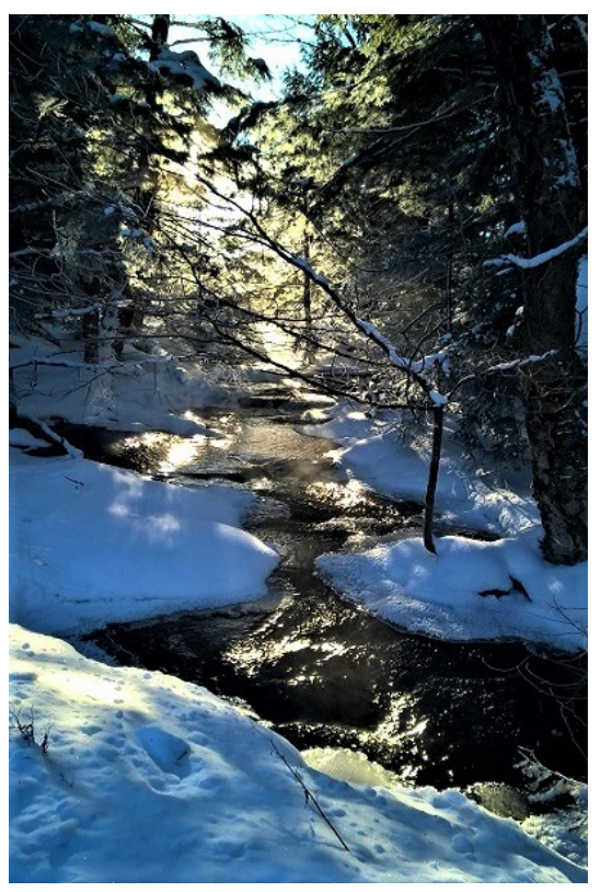
LLSA May 1 2020

And finally...a word on Covid-19 from our furry friends