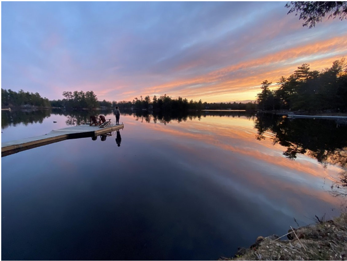
above on April 26 - a sunset we could not get enough of, and below - the falls at their peak on April 14