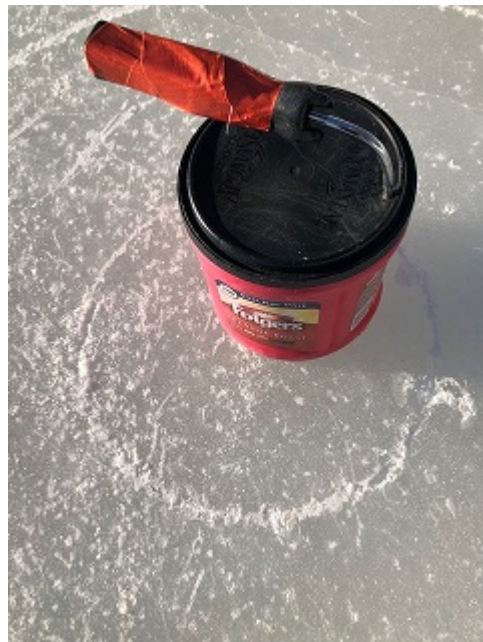
The Wallace Leonard Lake Curling Rink - a culmination of hard work, skill and ingenuity - drink a lot of Folgers coffee then repurpose the cans as curling stones!