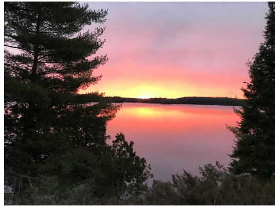
January scene and winter sunrise Mark Scarrow